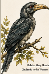
Malabar Grey Hornbill (Endemic to the Western Ghats)

From misty shola forests and rolling grasslands to tea estates, spice gardens, streams and lakes—each habitat holds a unique ensemble of birds. Explore slowly, listen carefully, and let the Munnar landscape reveal its feathered treasures.